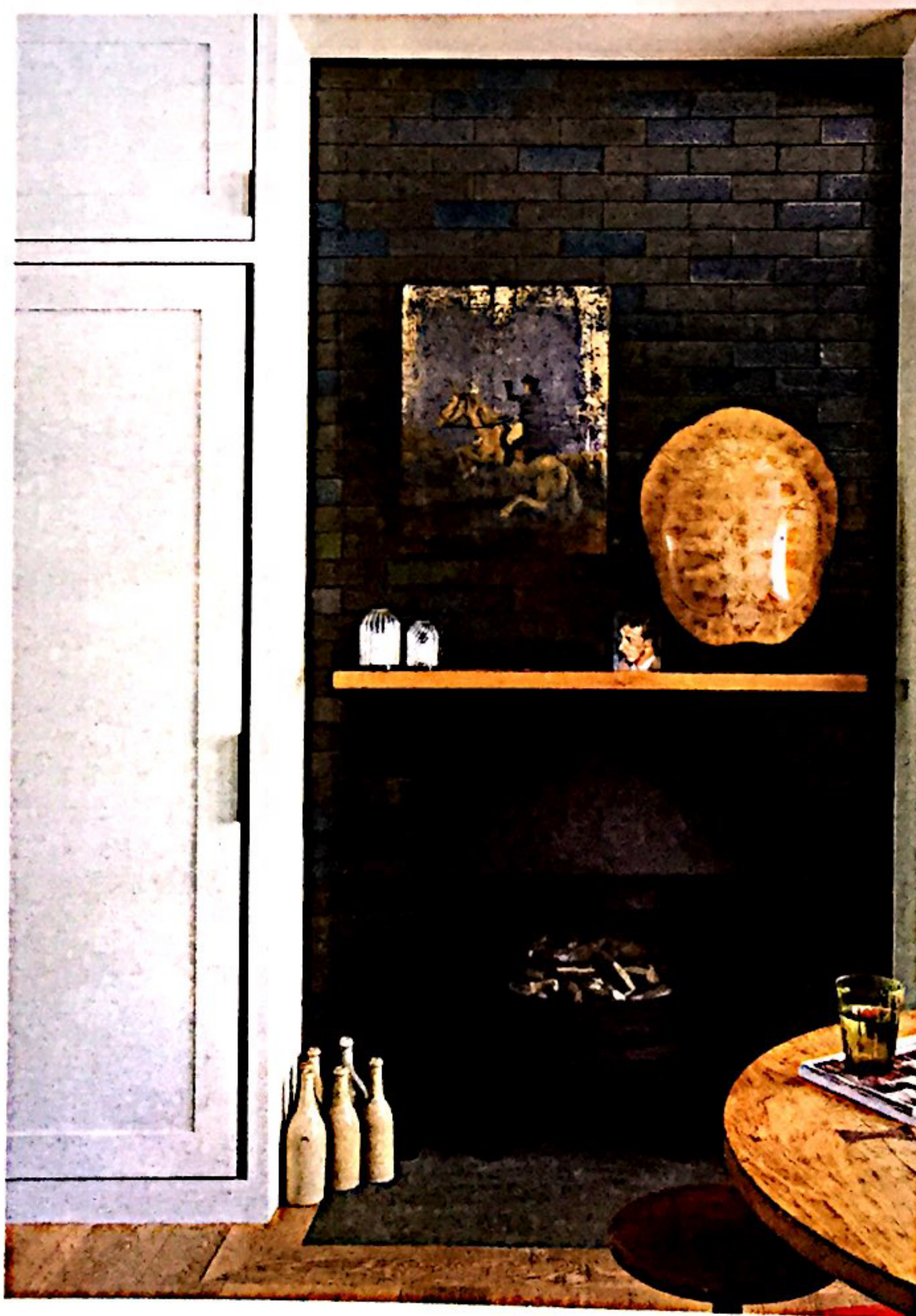
Top: Adam Brown. Above: the wood burner is by Jotul. 'We wanted the breakfast area to be cosy on freezing mornings,' Brown says. The albino turtle shell is from Dover Street Market and the vintage painting was an antiques-market find that cost £10